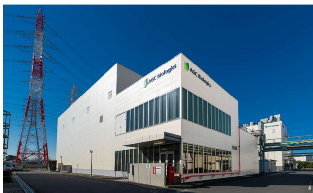
AGC Biologics' Chiba site